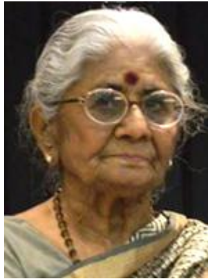
Mannu Bhandari Eminent Academic Do Hindi MH 1964-1991 Renowned Hindi novelist 'Aap ka Banti' and 'Mahabhoj' 2000