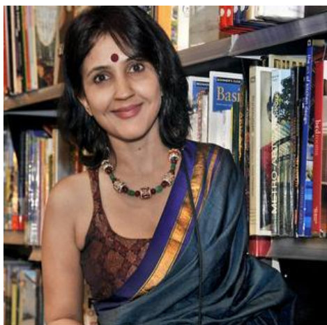
Anuja Chauhan BA Eco LSR Awardwinning author and acknowledged columnist - commentator